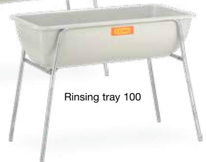
Rinsing tray 100