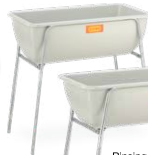
Rinsing tray 75