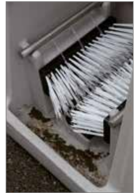
integral tray to collect dirty water and enable disposal with 1 1/2" connection