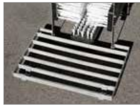
Accessory: Scraper grate for coarse dirt