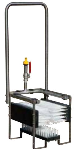
Boot cleaner ECO